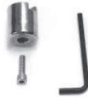
Locking set (included)

STEAMIX Model 2033 includes 25 feet of "safety yellow" washdown hose, rubber cushioned spray nozzle with swivel adapter and a stainless steel nozzle hook.