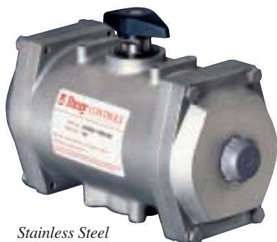
Stainless Steel Actuator

acting units. The Series 93 spring cartridges are inherently safe. The standard spring cartridge system is available for 40, 60, 80 and 100 psi services (3, 4, 5, 6 and 7 bar). NAMUR interface of air supply ports is standard on all Series 92/93 actuators. In addition, Bray actuators comply with ISO 5211 and VDI/VDE 3845 (NAMUR recommendations) dimensions and mount directly to Bray valves without using external linkages. Standard units have anodized aluminum bodies with polyester coated end caps. Stainless Steel and Electroless Nickel plated aluminum actuators are available.